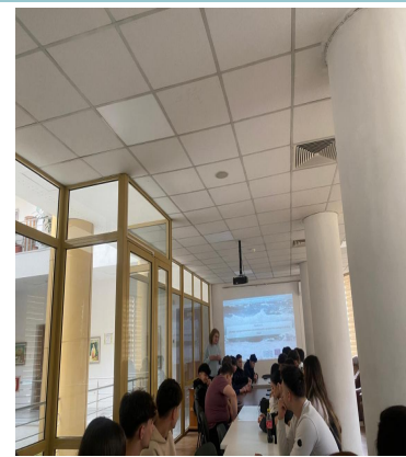
Students engaged in a wider classroom session.