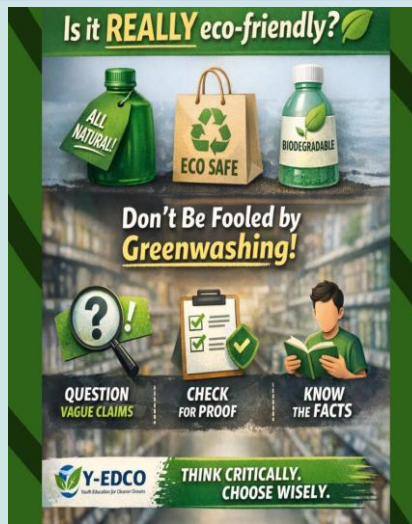
Greenwashing awareness and informed consumer choices

Post theme: building a sustainable future