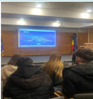
Presentation and group viewing during the activity.

YYOUTH continues to strengthen the project's youth-centred and entrepreneurial dimension, contributing perspectives on active citizenship, inclusion and social impact. The materials under development encourage young people to understand plastic pollution and imagine practical community-based solutions.