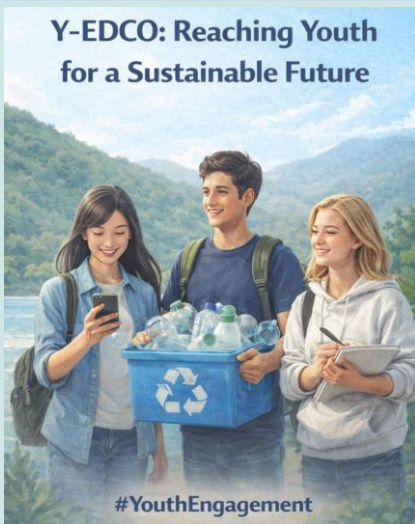
Youth engagement and sustainability awareness

Dissemination remains a core part of Y-EDCO at mid-project stage. Through coordinated posts and visuals, the partnership continues to share project milestones, educational messages and practical sustainability themes with a wider audience. Recent LinkedIn materials have highlighted youth engagement, greenwashing awareness and the expected results of the project.