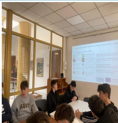
Discussion session using Y-EDCO educational slides.