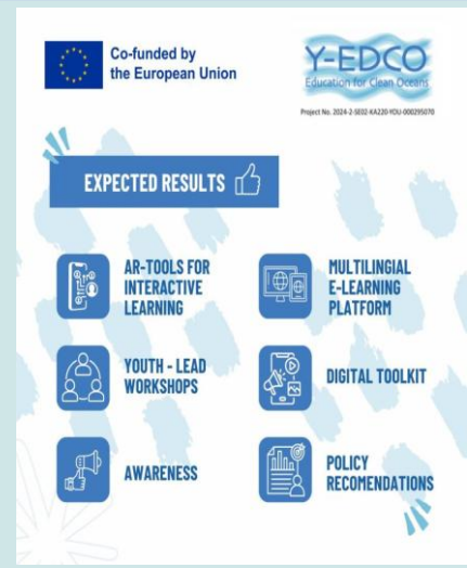
Project goals, expected results and key outputs

Post theme: think critically, choose wisely