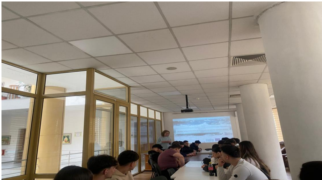
Students taking part in a Y-EDCO awareness activity during Romania's Green Week programme.